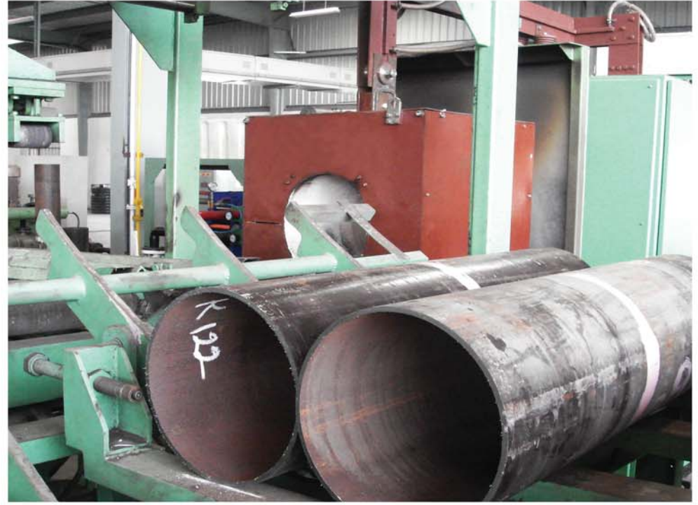
Meeting thermal challenges through Induction